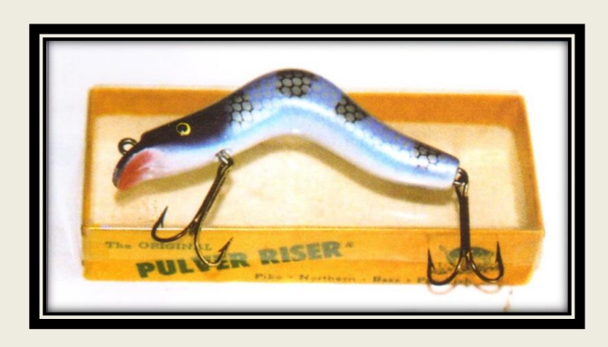
2400 Series blue scale finish Pulver Riser, special color. Purchased by special request only. Lynn thinks he made only about 200 in this color.

At first, the entire assembly process and finishing was done by Lynn and Alice in their home and garage. In time, they rented a building across the street where all the lures were painted, and later, they purchased a larger house where all the assembly and painting was done. At times, they hired part-time help as well.