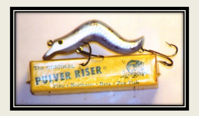
1El Leecho 700 series. Color: Silver (Std. color)